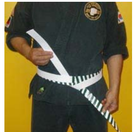
6. Pull to tighten. One strip will be upwards, the other downwards.