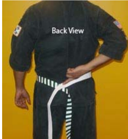
2. Wrap around and tuck one side underneath.