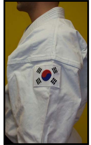
Korean Flag Red side is on top