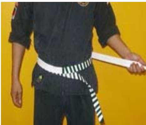
4. Bring both ends to the front ensuring equal length.