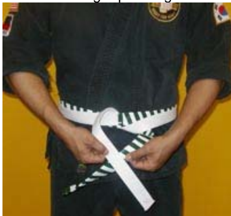
7. Place top strip across other strip.