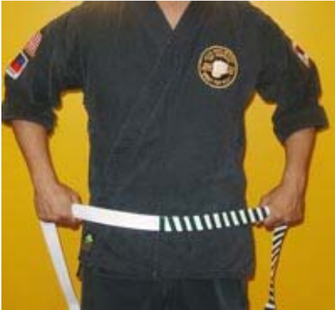
1. Start with center of belt in the middle