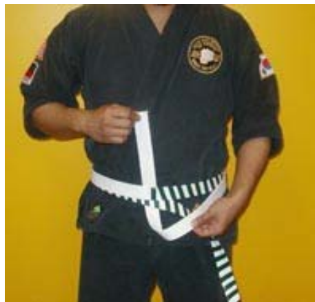
5. Tuck top strip underneath both loops.