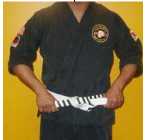
8. Place top strip through loop.