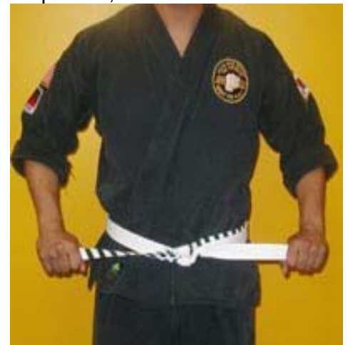
9. Pull sideways to tighten.