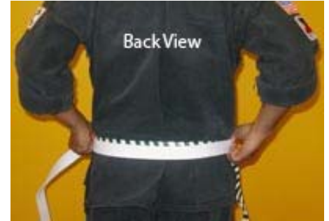
3. Wrap back around to front. One strip is underneath the other.